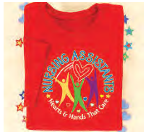
Nursing Assistants: Hearts & Hands That Care