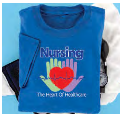
Nursing: The Heart Of Healthcare