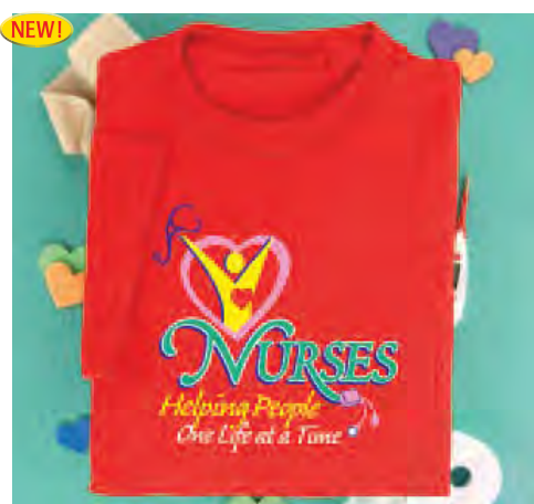
Nurses: Helping People One Life At A Time