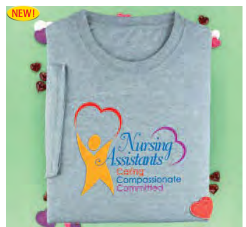
Nursing Assistants: Caring, Compassionate, Committed