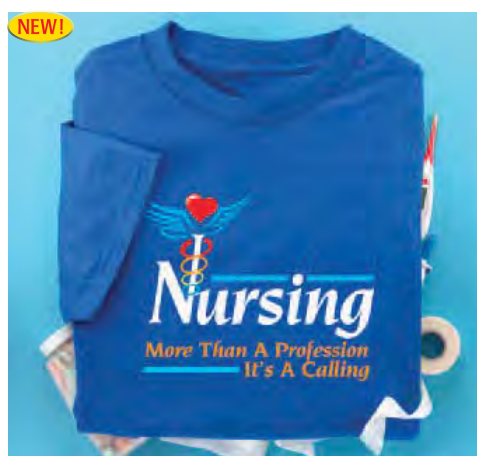
Nursing: More Than A Profession, It's A Calling