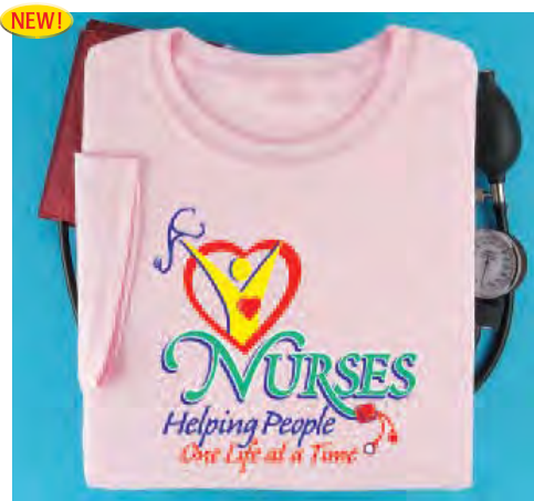
Nurses: Helping People One Life At A Time