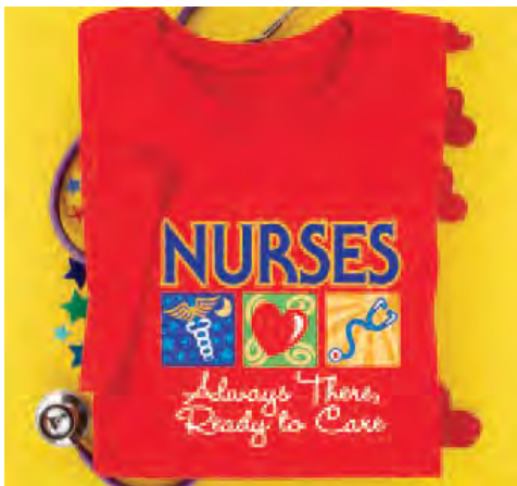
Nurses: Always There, Ready To Care