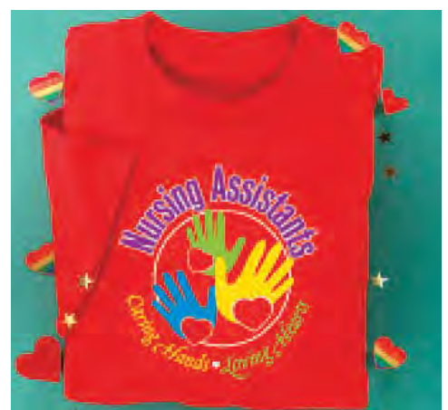
Nursing Assistants: Caring Hands, Loving Hearts